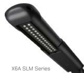
X6A SLM Series

- Cree LED X6A SLM Series - 49W and 88W, Type 2 and 3 optics - 80 Units at Oct 2014 - ongoing