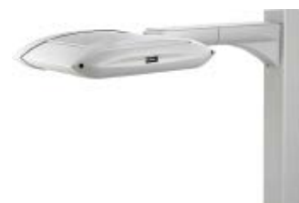
Edge Square Mount Series