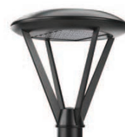
Edge Spider Mount Series